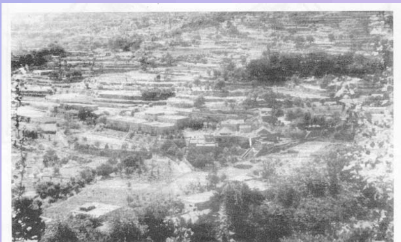
Open ended and sprawling agricultural lands

This environmental quality of Karimabad, is governed by vast green expanses, with small pockets of compact settlements in between. This dominant feature of terraced landscape gives the town its aesthetic appeal, which is a pleasure for the visitor.